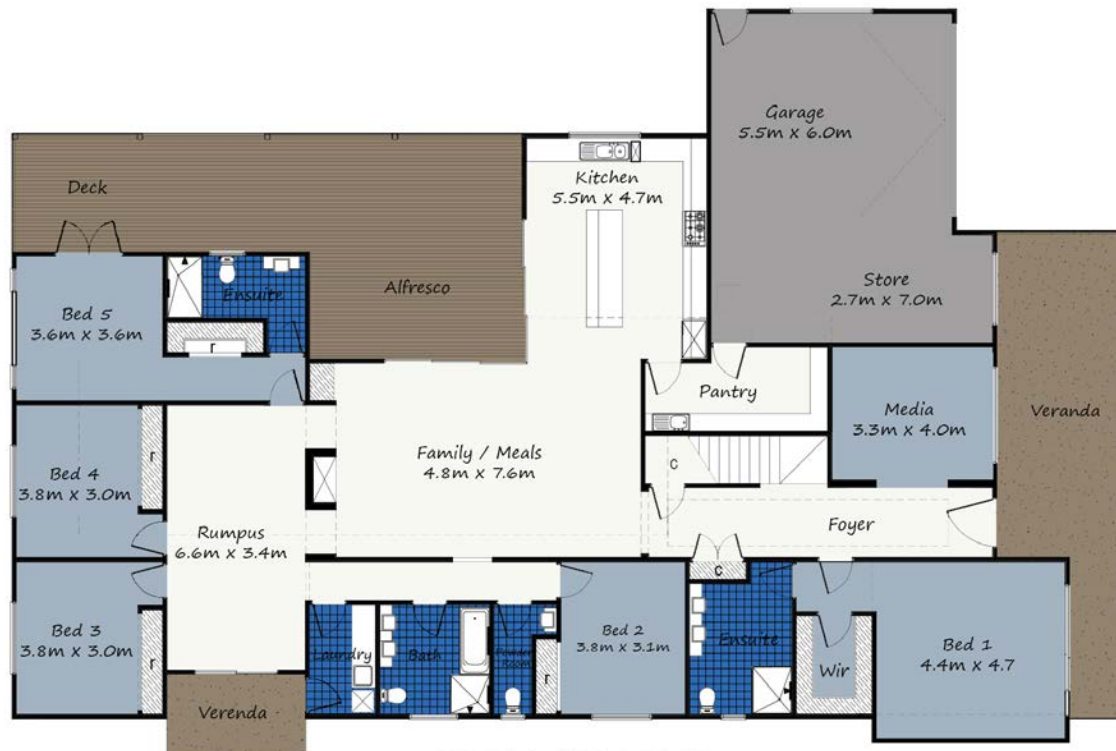
ground floor plan